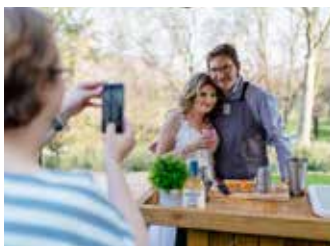
Great canapé area, craft beer on tap and a Gin cart