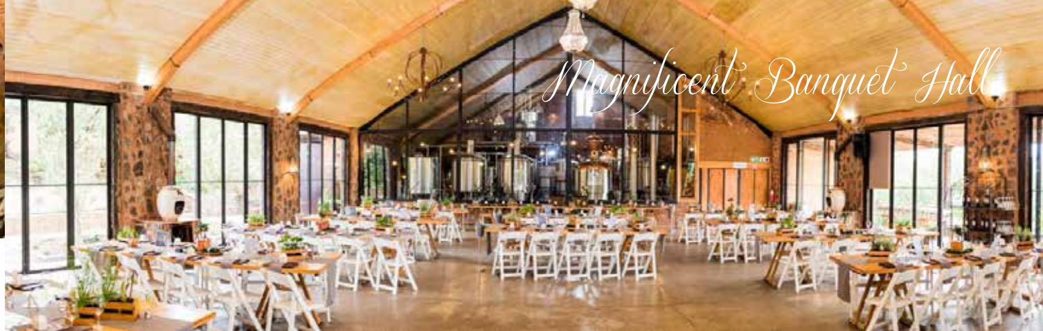
Magnificent Banquet Hall

Secure inside parking Refreshments on arrival