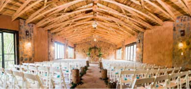
Furrow side chapel

Secure inside parking Refreshments on arrival